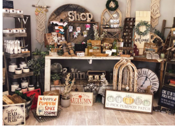
PULP & PINE DIY CRAFT STUDIO