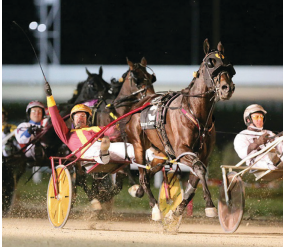
HARRAH'S HOOSIER PARK RACING & CASINO