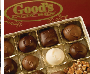
GOOD'S CANDY SHOP