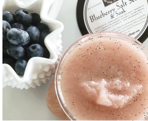
SIMPLE GOODNESS SOAPS