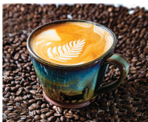
FALLS PERK COFFEE HOUSE