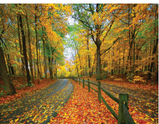
MOUNDS STATE PARK

Anderson Museum of Art, Warner Sallman Collection and Jeeninga Museum (Biblical Archaeology) at Anderson University's York Performance Hall and Galleries , and the Museum of Madison County History . Check out a concert at Harrah's Hoosier Park Racing & Casino or Anderson Symphony Orchestra at the Historic Paramount Theatre .