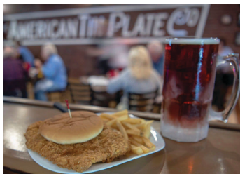
THE TIN PLATE (BREADED TENDERLOIN)