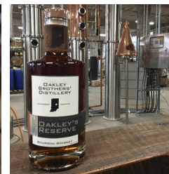
OAKLEY BROTHERS DISTILLERY