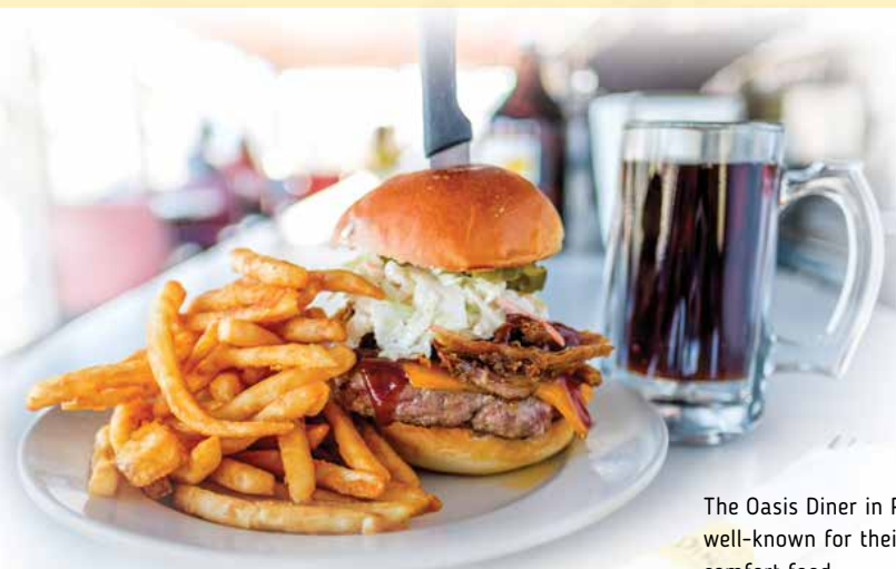
The Oasis Diner in Plainfield is well-known for their American comfort food.

The Lemon Drop restaurant's four booths and eleven counter stools seat a total of just 27. Covid added thick plastic sheets and acrylic partitions that helped ensure diners' safety, and kept the tradition going throughout the past year.