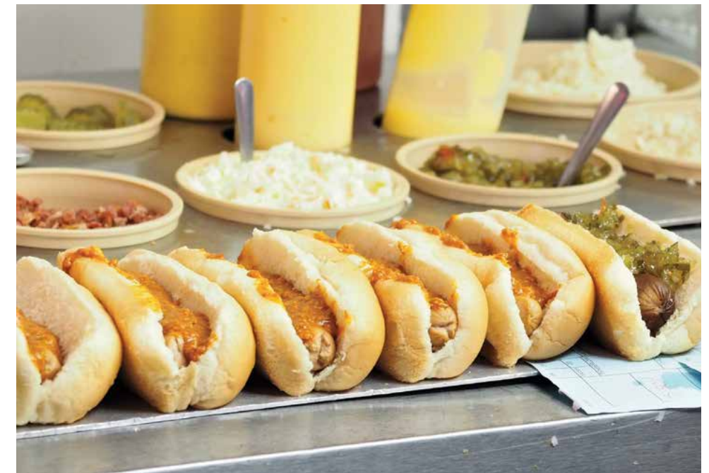
Classic hot dogs with all the trimmings are on the menu at Gene's Root Beer and Hot Dogs in Anderson.

The " I Scream for Ice Cream Trail " has 25 stops. Soft serve,