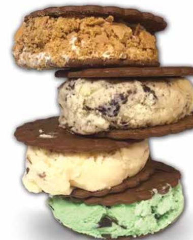
Big Wheels at Ivanhoes, home to more than 100 flavors of shakes and sundaes.