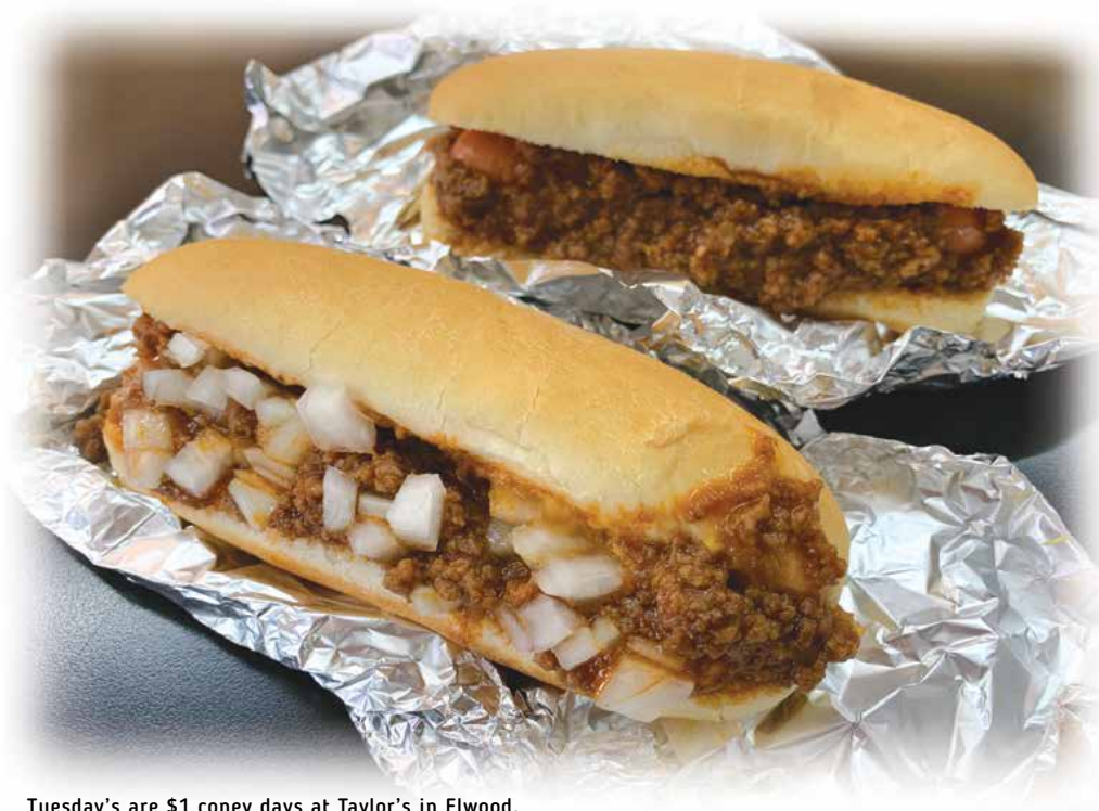
Tuesday's are $1 coney days at Taylor's in Elwood.

Know that stops on these trails are also on additional Foodways trails. Look for all the culinary trails at indianafoodways.com . And as you leave the Lemon Drop, be sure to grab a lemon drop.