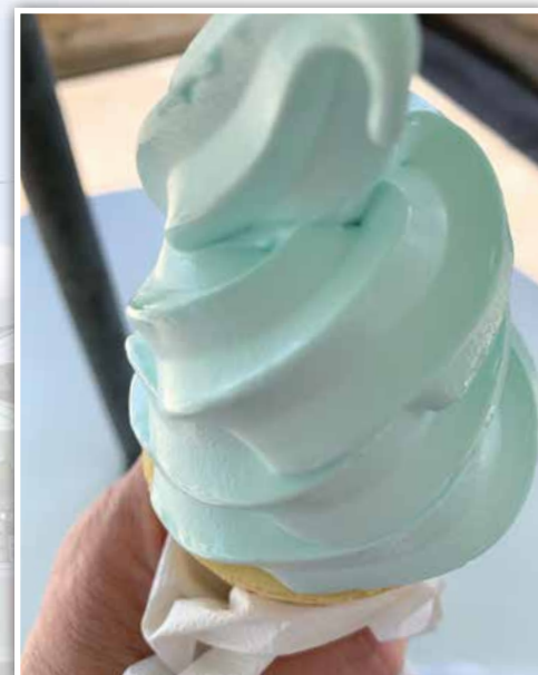
One of the newest ice cream flavors at Frazier's Dairy Maid in Anderson is the blue moon.

frozen custard, hand-dipped – often in homemade cones. When you see a line of people at the window, you know it's gotta' be good.