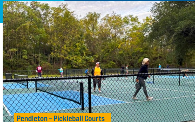
Pendleton – Pickleball Courts