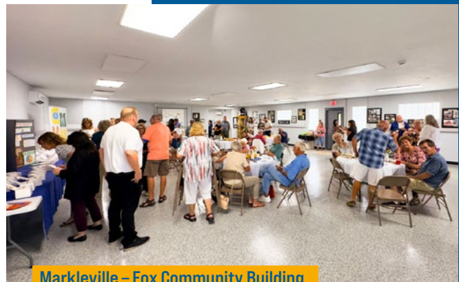
Markleville – Fox Community Building

6335 S Scatterfield Rd Anderson, IN 46013 VisitAndersonMadisonCounty.com Info@VisitAMCVB.com