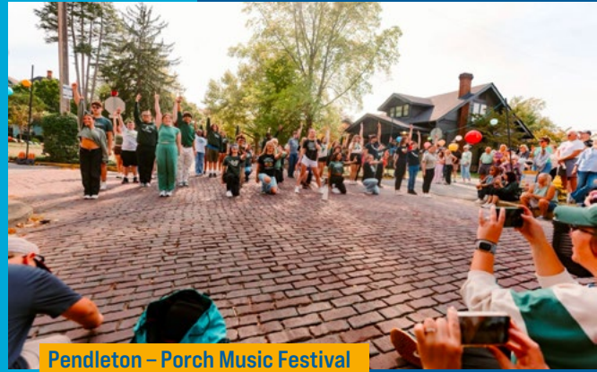
Pendleton – Porch Music Festival